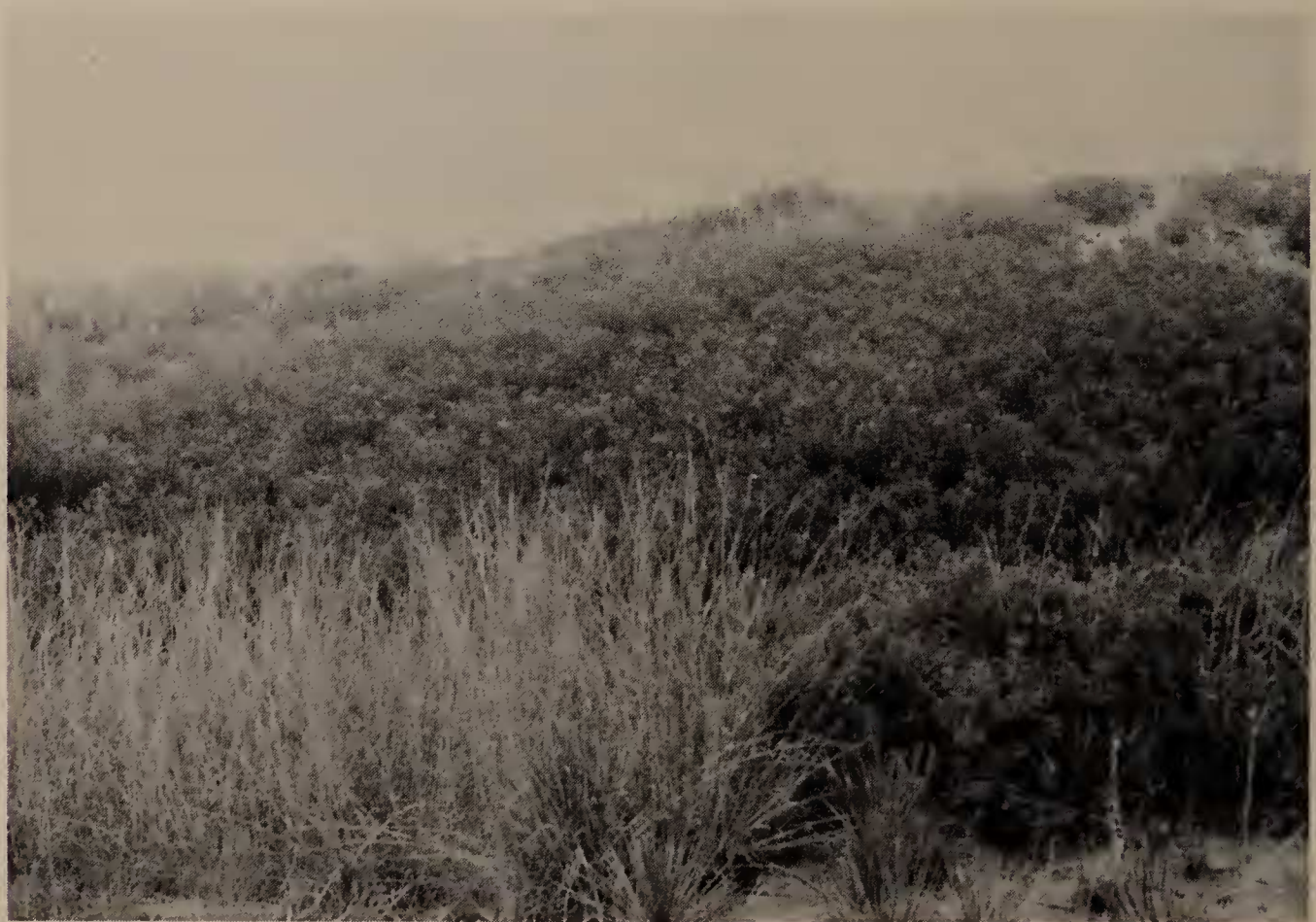
FIG. 5.—Havard shin oak-mixed grass community, western Bailey County.